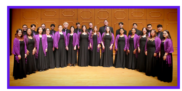
The NSU Chamber Choir

**Clinic locations will be announced during the welcome session and displayed in Hanchey Lobby.