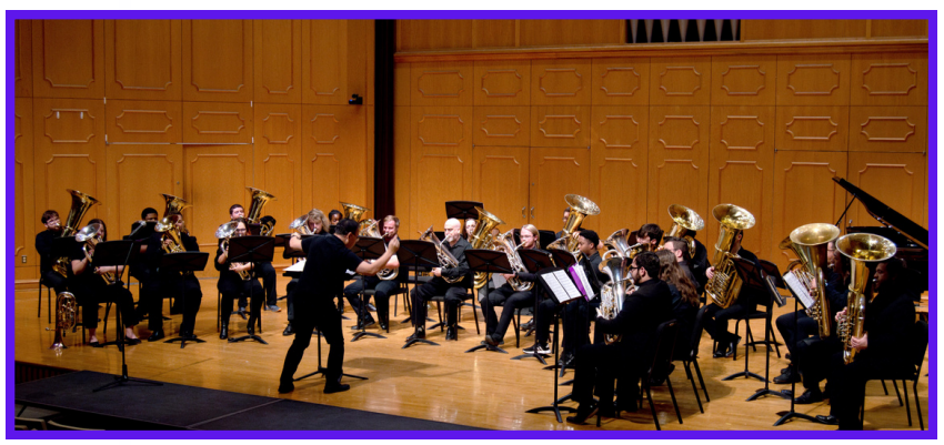
The NSU Tuba and Euphonium Studio