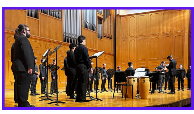
The NSU Mens Chorus