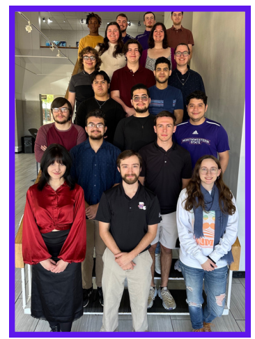
The NSU Percussion Studio